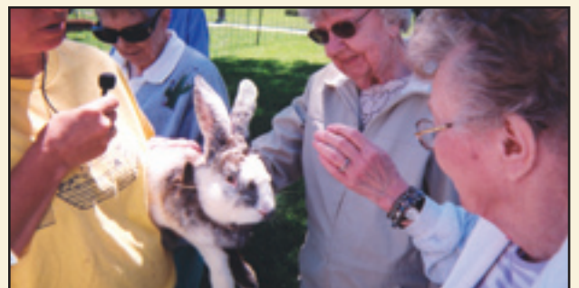
Residents enjoy the outdoors and animals at Villa Loretto.

The baskets made in Crafters' Corner will be the perfect addition to a spring table.