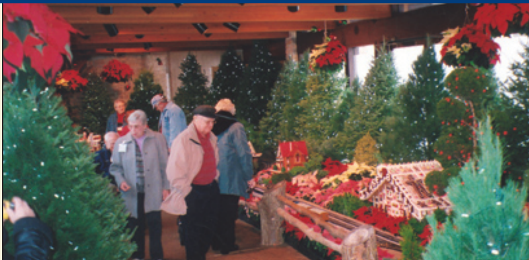
Nothing says the holidays like a walk through the poinsettias at Olbrich Botanical Gardens.

The holidays are in full swing and we're celebrating the sights, smells and sounds that make this the happiest season of all. Our long list of merry events includes something for everyone: festive light tours, holiday crafts and music programs. As the Wisconsin winter wonderland settles in, we'll be busy with classes, cooking demonstrations, happy hours, and touring the world with Armchair Travel.